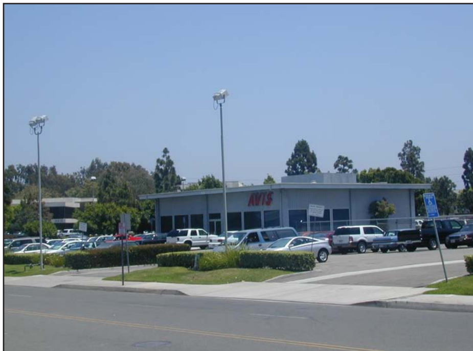
Figure 2-2 View of Platt College from Dove Street